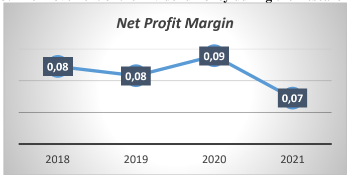
Figure 4. The Movement of the Financial Performance during the Research Period