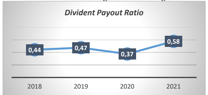
Figure 3. The Movement of the Dividend Policy during the Research Period