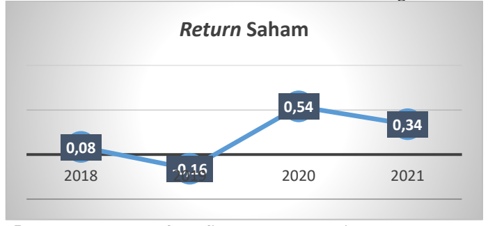
Figure 5. The Movement of the Stock Return during the Research Period