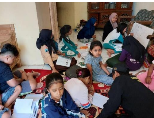
Figure 4. The Second Location, First Meeting

2. The second location is at the residence of the head of the RT. 05 RW. 04 after school hours. The low class category on average already knows letters but is still not fluent in reading. On the other hand, it was also found that grade 2 students still had difficulty distinguishing letters and reading syllables.