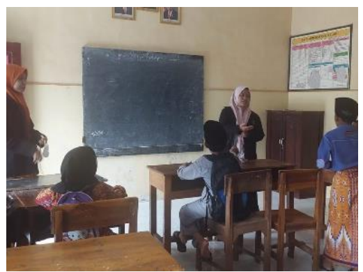
Figure 8. The Fourth Location, First Meeting