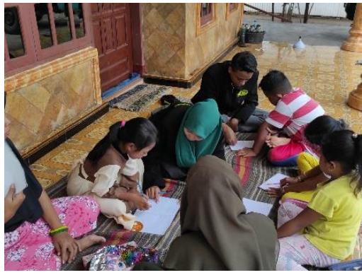
Figure 5. The Second Location, Second Meeting

3. The third location is at the residence of the head of the RW. 02, found a case that was quite severe because it was not a low class anymore but a high class child who was not yet fluent in reading and writing. However, in reading syllables, it is possible, only for consonants, I still don't understand.