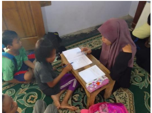
Figure 2. First Location, First Meeting