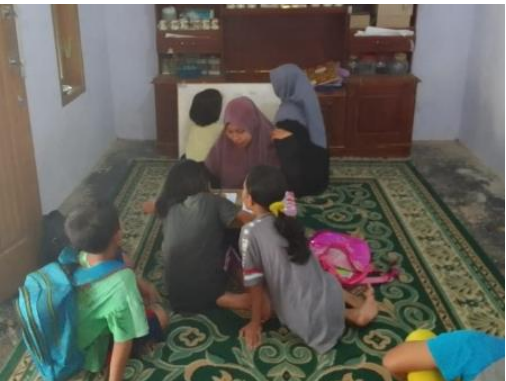
Figure 3. First Location, Second Meeting

2. The second location is at the residence of the head of the RT. 05 RW. 04 after school hours. The low class category on average already knows letters but is still not fluent in reading. On the other hand, it was also found that grade 2 students still had difficulty distinguishing letters and reading syllables.