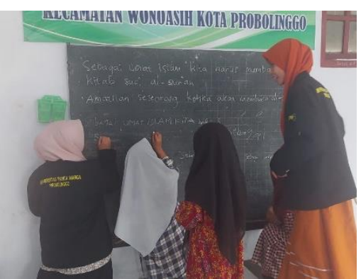
Figure 9. The Fourth Location, Second Meeting

The test sheets that we use as a reference in learning to read at the basic level to measure children's abilities are as follows: