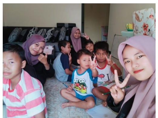
Figure 7. The Third Location, Second Meeting

4. The fourth location is held at the residence of the RW head. 03 by utilizing Miftahul Huda's TPQ class. Similar to the previous place, there were some high-class children who could not read syllables and consonants.