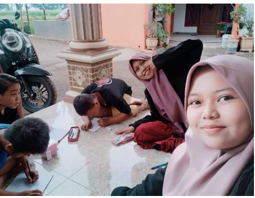
Figure 6. The Third Location, First Meeting

3. The third location is at the residence of the head of the RW. 02, found a case that was quite severe because it was not a low class anymore but a high class child who was not yet fluent in reading and writing. However, in reading syllables, it is possible, only for consonants, I still don't understand.