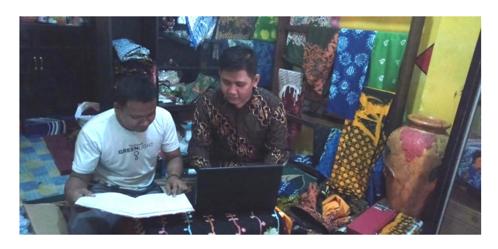
Figure 2. Assistance in Simple Financial Reporting