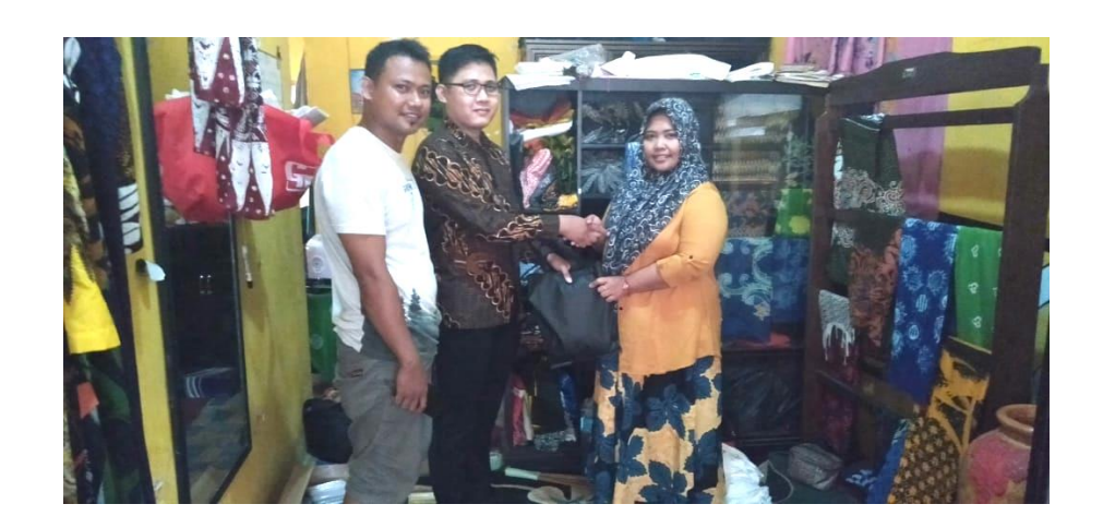
Figure 3. Gift Handover of Financial Reporting Guide Book