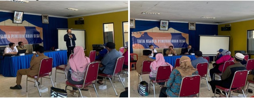
Figure 1. Policy Advocacy Activity

From the implementation of this activity, important information can be obtained about the understanding of the community in Wangunharia Village which is still not comprehensive about the development of tourism potential in the area. Based on the results of stakeholder participation in the FGD, a number of potentials and problems in the development of Wangunharja village as a potential tourism destination can be articulated in a Table 1 below.