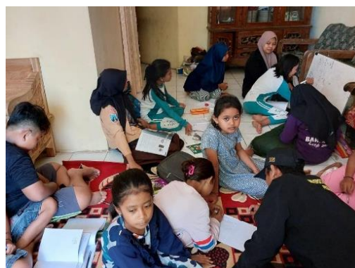
Figure 4. The Second Location, First Meeting