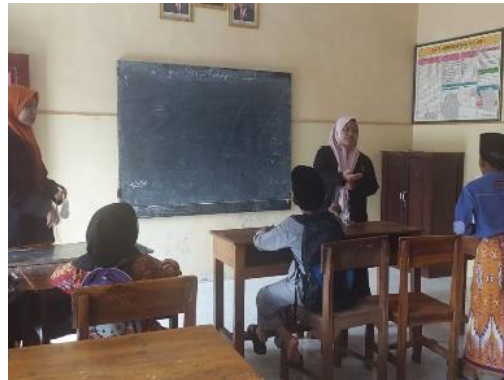
Figure 8. The Fourth Location, First Meeting