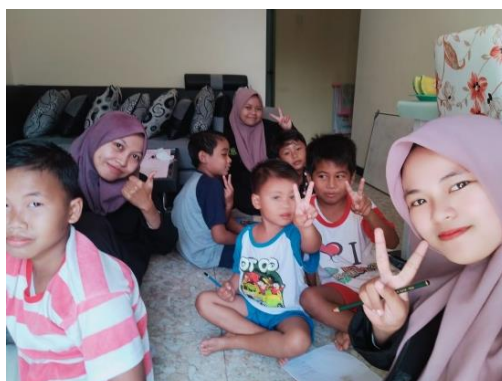
Figure 7. The Third Location, Second Meeting