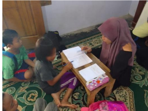
Figure 2. First Location, First Meeting