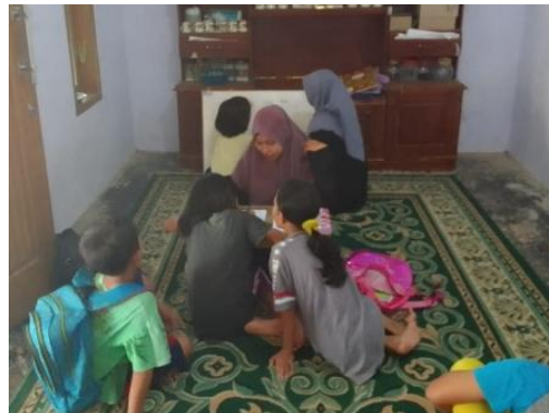
Figure 3. First Location, Second Meeting