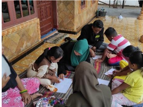
Figure 5. The Second Location, Second Meeting