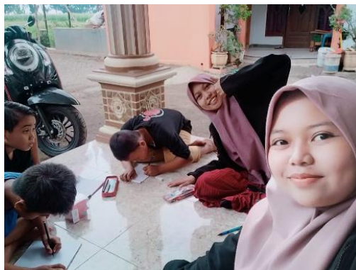
Figure 6. The Third Location, First Meeting