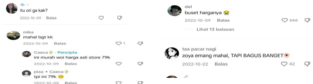
Figure 1. Public comments on the Zoya brand in Indonesia